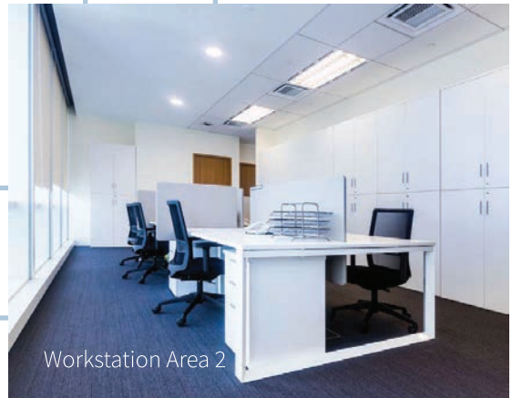
Workstation Area 2