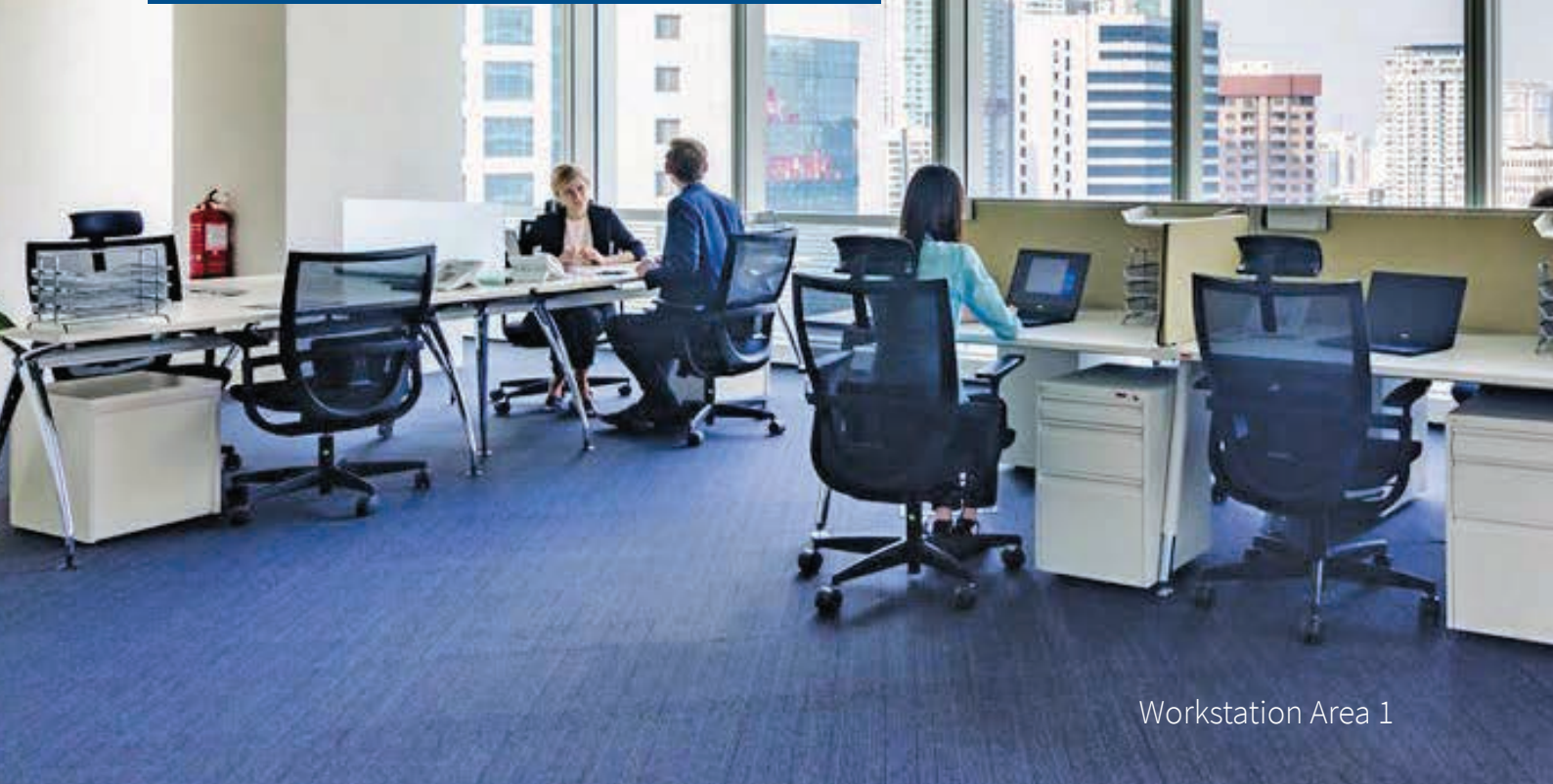
Workstation Area 1

Strategically located within the heart of KLCC's business district, the German Business Centre offers over 300sqm of modern office facilities ranging from shared offices, open workstations to individual office units and conference facilities.